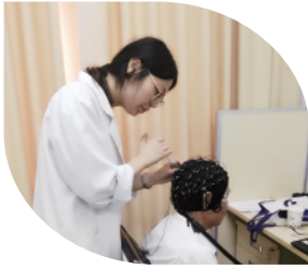
开展语言认知评估 The Center provides linguistic and cognitive assessment.

中心基于各种技术开展研究 The Center conducts research with ERP, fMRI and eye-tracking technology.