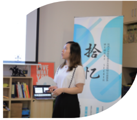
进行社区认知障碍干预 The Center provides cognitive impairment intervention service.

成立“拾忆”公益服务团队 The Center established a service team named "Memory Seeker".